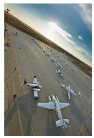
UND training aircraft at Grand Forks International Airport